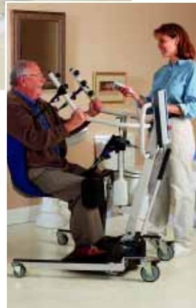
Shown with R134 Transport Sling.