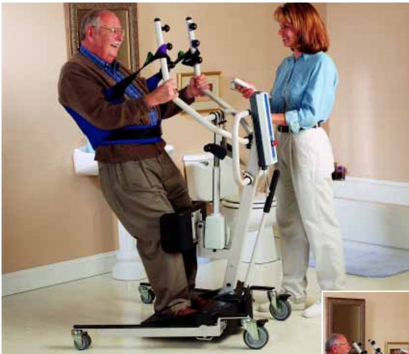
Shown with R130 standing sling.